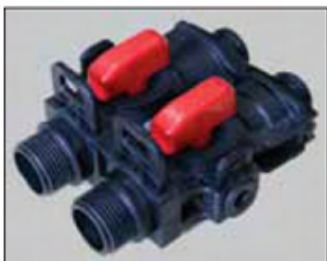
By-Pass is included using quick connect fittings.