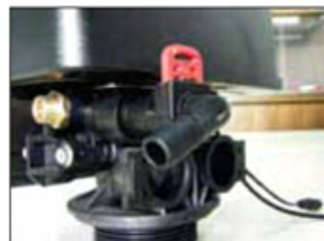
Drain line connection uses quick connect fittings.