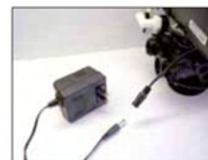
Quick connect power cord.