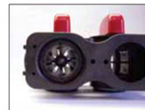
Meter is installed in the by-pass valve.